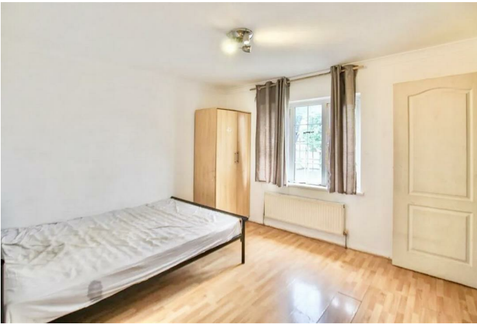
House - End Terrace (EPC Rating: D)